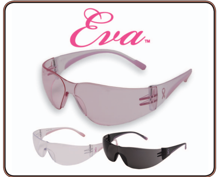
Polycarbonate lenses block 99.9% of the sun's ultraviolet rays. This ultraviolet protection has already been incorporated within the lens material when the lenses are being produced.

Country of Origin/Harmonization Code: Taiwan/9004.90.0000